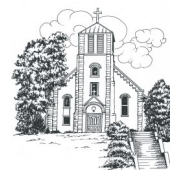
St. John the Baptist, Miltonsburg founded 1841