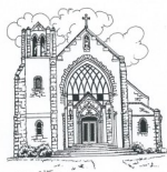
St. Sylvester, Woodsfield founded 1866